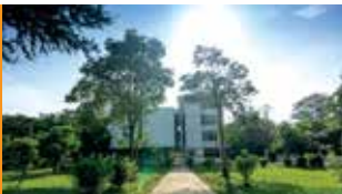
School of Law