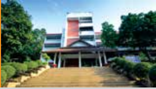
Faculty of Management Sciences