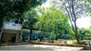
Faculty of Education