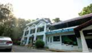
Faculty of Education