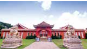
Thai-Chinese Friendship Center