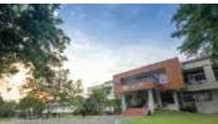
Faculty of Industrial Technology