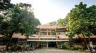
Faculty of Humanities