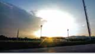
CRRU Sport Complex