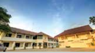
School of Health Sciences