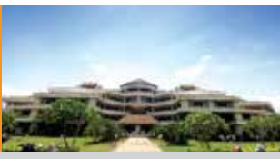
School of Computer and Information Technology, Language Institute and International Culture