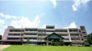
Faculty of Sciences and Technology