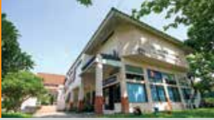
International College of Mekong Region