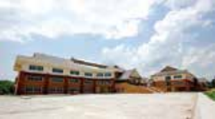
Lecture Hall Building 102