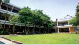
Faculty of Humanities