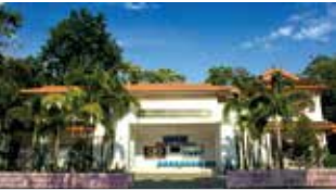
School of Traditional and Alternative Medicine