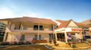
School of Accountancy