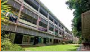
Faculty of Management Sciences