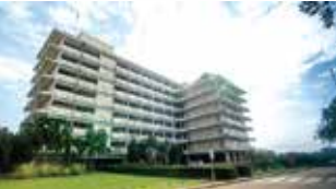
25 th Anniversary Lecture Building